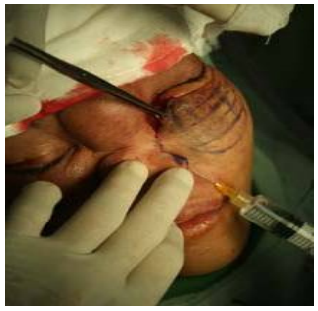
Figure 3. Intraoperative picture of a 37-year old female who presented with huge facial mass and epistaxis. She underwent wide excision of the AVM and facial reconstruction.