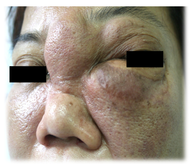
Figure 1. Preoperative picture of 37-year old female who presented with huge facial mass and epistaxis.

This mass was initially a 1 cm x1 cm soft pulsating non tender mass on her left infraorbital area, which further enlarged to a size of 4 cm x 4 cm and extended to the frontal area. She became hypertensive three years prior to admission, and concurrent with her hypertension, the patient noted significant enlargement of the mass with associated protrusion of her left eye. Several days prior to admission, she experienced profuse nosebleeding from her left nostril (about half a glass) and bleeding from her left eye after she forgot to take her antihypertensive medication. The bleeding then resolved spontaneously.